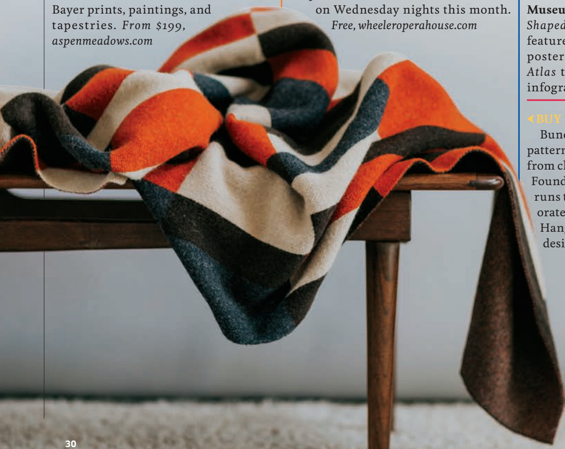
© Robert Millman (sculpture); courtesy of Aspen Meadows Resort (hotel); Apic/Getty Images (Bauhaus costumes); Aspen Historical Society (ski poster); courtesy of Maker (blanket)

Bundle up in a blocky, Bauhaus-patterned cashmere or camel throw from chic houseware retailer Maker . Founder Michaela Carpenter, who also runs the attached café, Local, collaborated with Mongolian weavers from Hangai Mountain Textiles on the designs. From $630, makerandplace.com